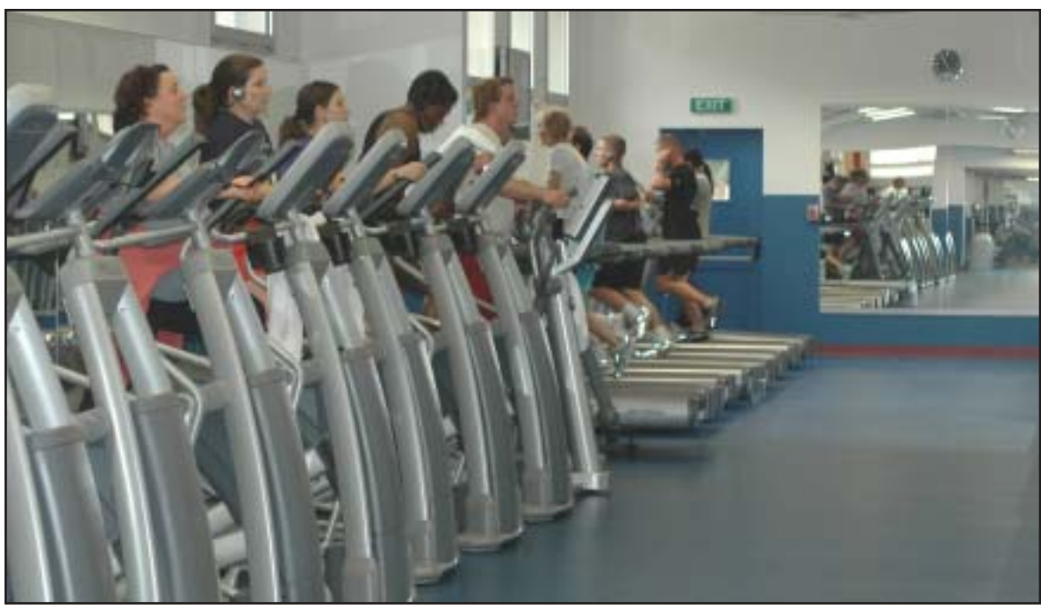
(Above) Vicenza fitness enthusiasts work out in the aerobic machines room in the post fitness center. The center reopened Sept. 14 after months of renovation and now included a physical therapy room and wellness center.