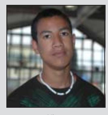
Viane Family member

Baseball, because it's an easy sport to play.