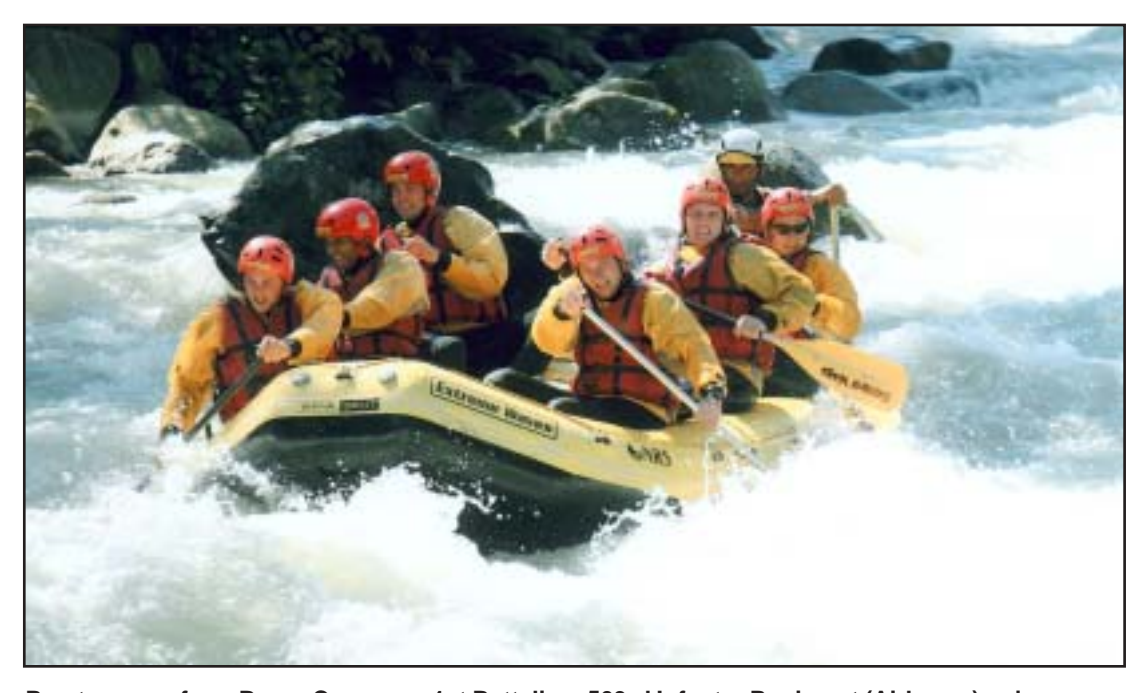
Paratroopers from Bravo Company, 1st Battalion, 503rd Infantry Regiment (Airborne) enjoy some white-water rafting while participating in the Warrior Adventure Quest pilot program Sept. 8, in Vicenza, Italy.

After the last day's adventure, all the WAQ'ers gathered outside the Golden Lion on Caserma Ederle for a final b a r b e c u e celebration, and to reminisce their adventures and accomplishments.