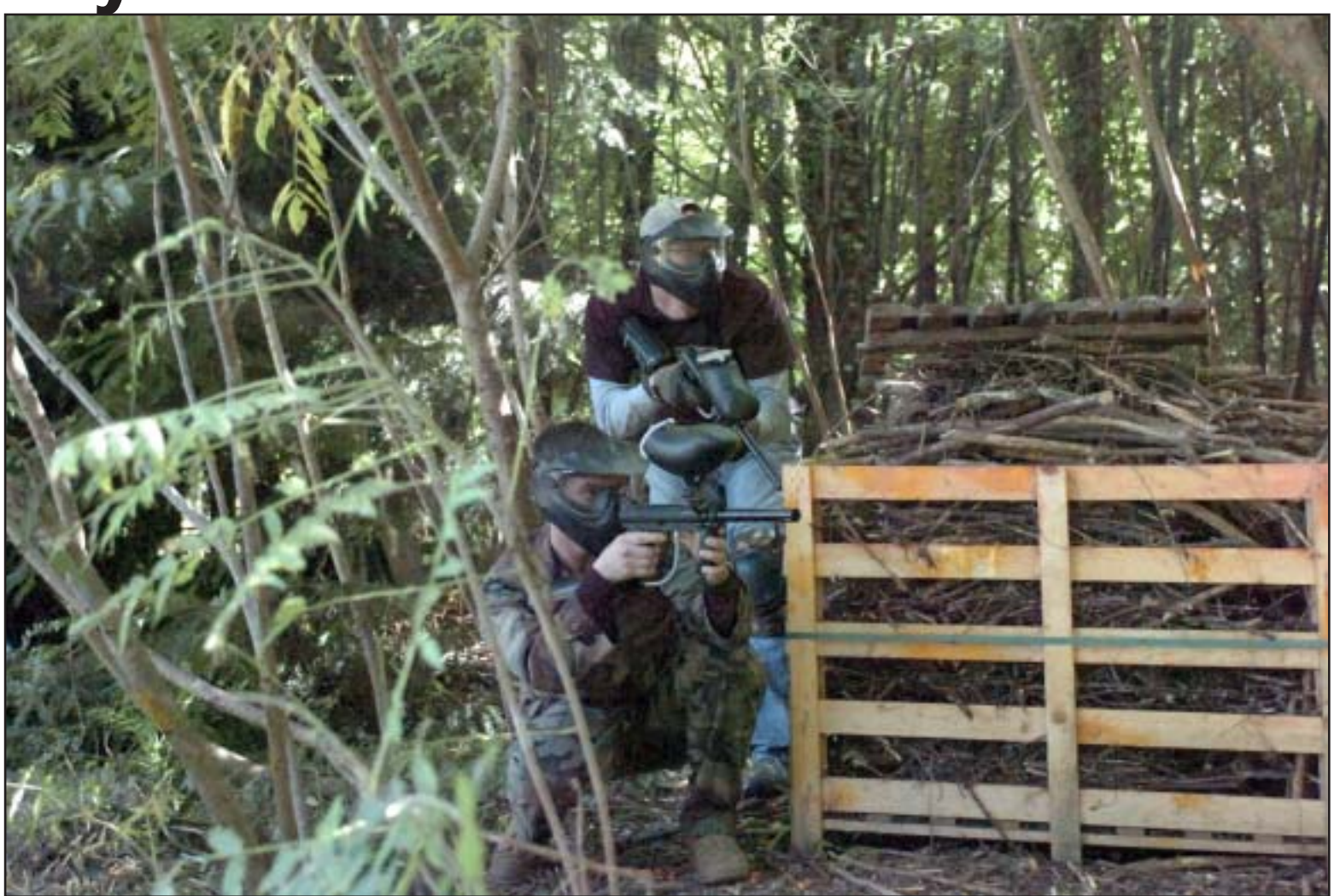
Sky Soldiers from Bravo Company, 1st Battalion, 503rd Infantry Regiment (Airborne), take aim on the enemy during a free game of paintball on a course in Padova, thanks to the Warrior Adventure Quest pilot program Sept. 9.